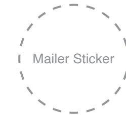
Mailer Sticker (Step 7)

For Patient Frequently Asked Questions please visit: